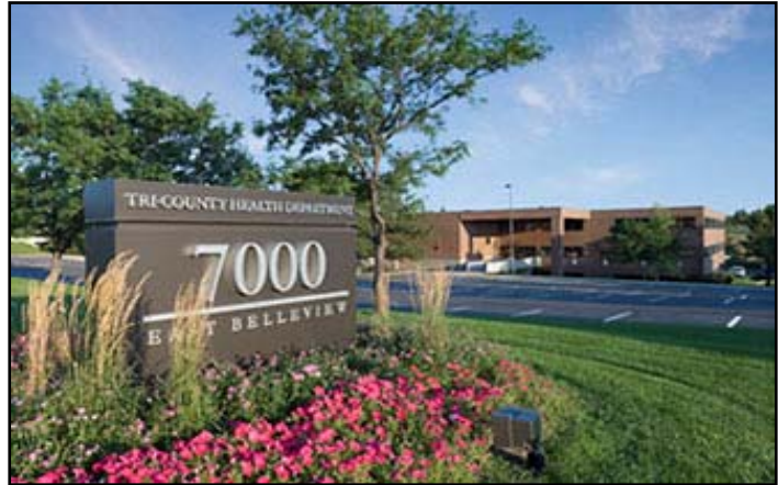
Tri-County Health Department Administrative Office

Tri-County Health Department, founded in 1948, currently serves over one million residents in Adams, Arapahoe and Douglas Counties, three of seven counties that make up the Metro Denver area. Tri-County Health has eleven offices staffed by registered dietitians, nurses, health educators, environmentalists and other health professionals as well as satellite offices offering WIC services only. TCHD is a national leader in public health and has received many awards for innovative services.